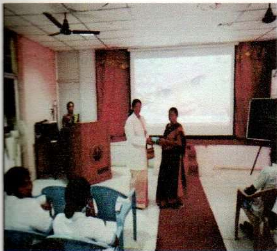
Behavioral Disorders among Children