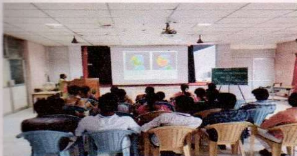
Effect of Technology on Children

Journal Club Meeting on 23.07.2018 and presented a journal article on “Toxic Synovitis” it is inflammation of the hip which cause limping and pain in the hip and leg, it is caused by viral infection.