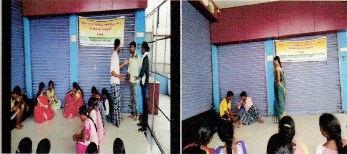
Child Labour Day marked at Seeragapadi