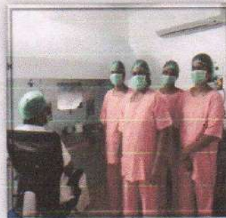
FACULTY IN PATHOLOGY ROOM

One week training programme for Faculty was organized on "In-vitro Fertilization" at Aksaya Fertility Clinic.