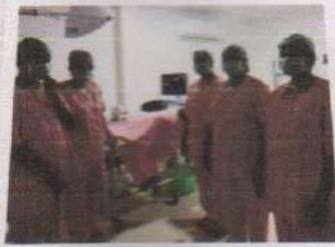
FACULTY IN PROCEDURE ROOM

One week training programme for Faculty was organized on "In-vitro Fertilization" at Aksaya Fertility Clinic.